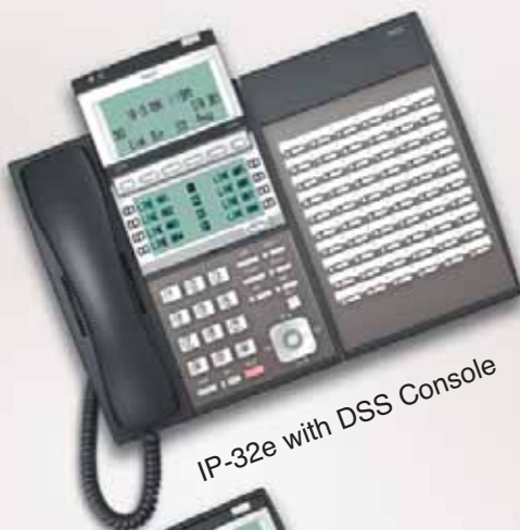
IP-32e with DSS Console

The UX5000 offers an impressive array of high-performance IP and digital proprietary terminals. Choose from display and non-display, handsfree or full-duplex handsfree models. Select models offer backlit display and illuminated dial pad. All features not available on all models. Description depicts an enhanced IP Terminal.